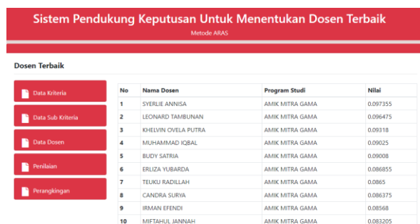
Image 2. The Best Lecturer Ranking Results Using the Application