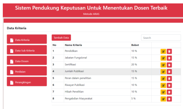
Image 1. Criteria Data Page On Application