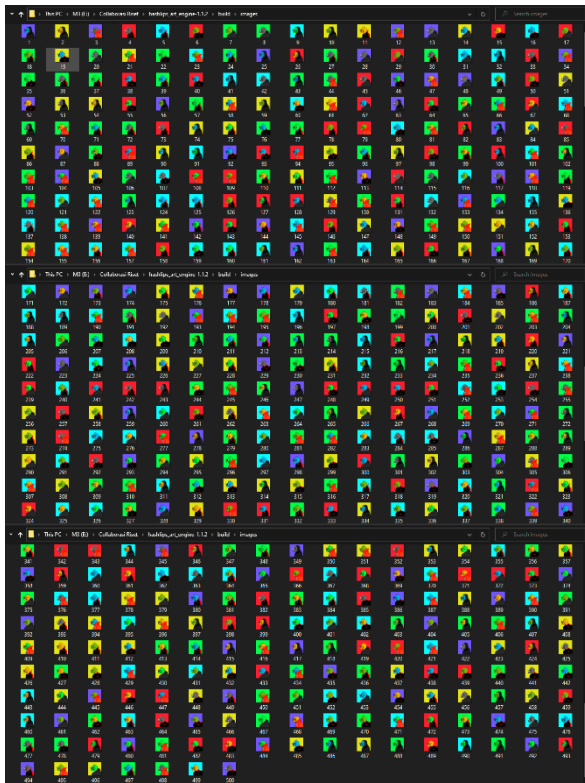
Figure 5 The resulting NFT image

Figure 5 shows the results of creating an NFT using the HashLips Art Engine system by utilizing as many as 25 image layers to create 500 different image variations and have their own metadata that can make these images marketable on the opensea.io platform.